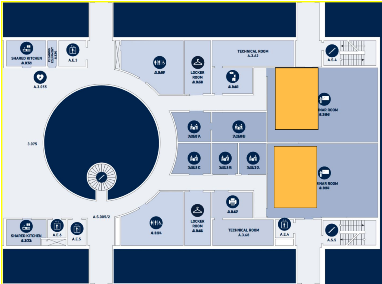
Main Venue, 3 rd Floor.